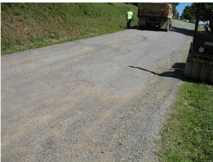
Hill on Palumbo Road, before paving