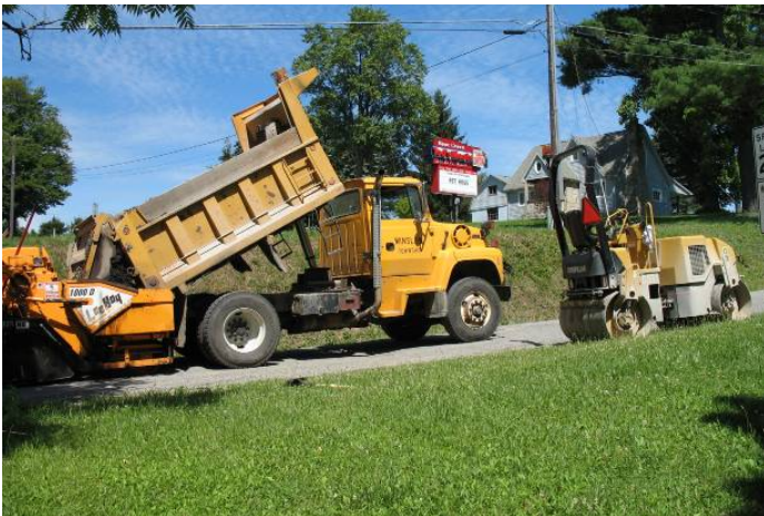
All equipment required

Roadmaster: Bob Krajewski, 814-591-6953 Job: Palumbo Road, tar & chip base Crew: 3 men including hauler